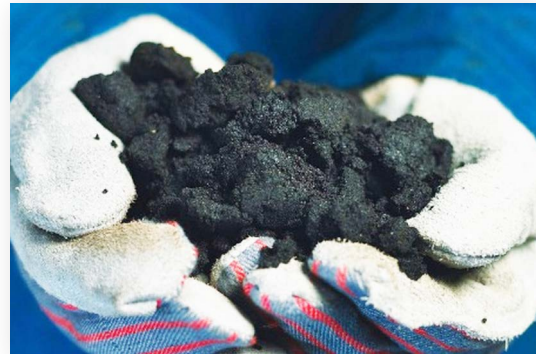
An oil sands facility in Alberta, Canada, selected B&W to supply a high-efficiency, high-reliability, low-emissions steam generation solution.

To achieve the project's goals, B&W supplied eight industrial water-tube boilers, each designed for a peak capacity of 286 T/h. To provide steam availability during power outages, two of each set of four boilers were engineered to operate without power from the grid. This was accomplished by driving the fans with steam turbines rather than motors and connecting all other required components to an uninterruptible power supply. To offset the impact of any natural gas interruption, one boiler in each set of four was designed to fire No. 2 oil to generate the full 260 T/h at 6500 kPag/432C (943 psi/810F). In the summer when steam demand is lower, the boilers can be rotated out of service for scheduled maintenance.